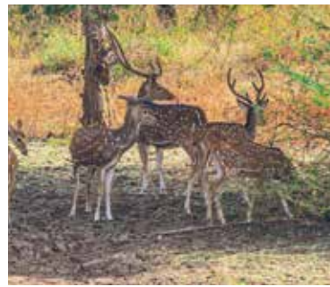
Vansda National Park