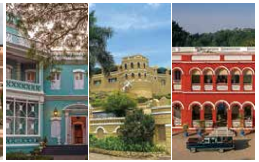
Riverside, Khirasara, Orchard palace; Rajkot

Flora - Fauna: Gujarat wildlife sanctuaries are known for exotic collections of flora and fauna species. The topographical location gifted Gujarat with 4 National Parks and 21 Wildlife Sanctuaries.