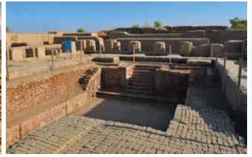
Surkotda indus valley civilization (197 km from Ahmedabad)

Heritage sites: landscapes of Gujarat are ruled by rulers of many dynasties, invaders and sellers; one can see the massive forts, charming havelis, stunning stepwells and many other historical sites that showcase some of the relics of the land.