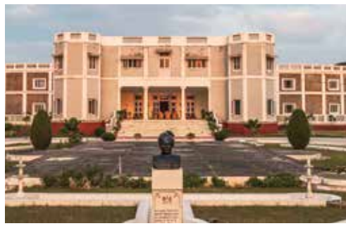
Dowlat Vilas Palace, Sabarkantha