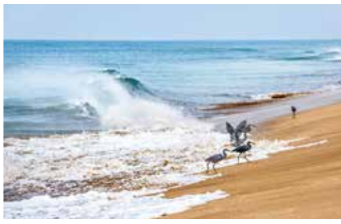
Madhavpur beach, Porbandar (390 km from Ahmedabad)