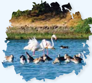
Thol lake (29 km from Ahmedabad)