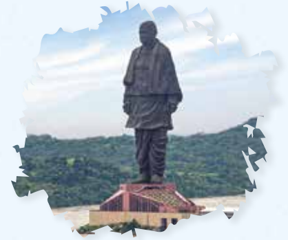
Statue of unity (narmada) (197 km from Ahmedabad)