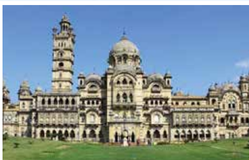
Lakshmi Vilas Palace, Baroda