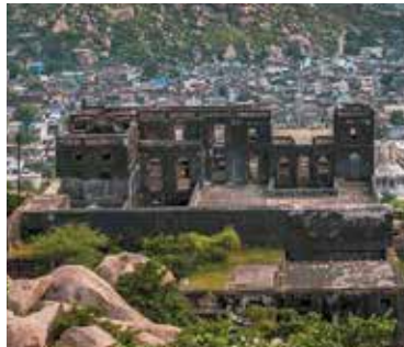
Idar fort, Sabarkantha