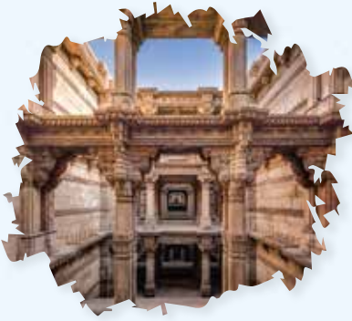
Adalaj ni vav (Gandhinagar) (19 km from Ahmedabad)