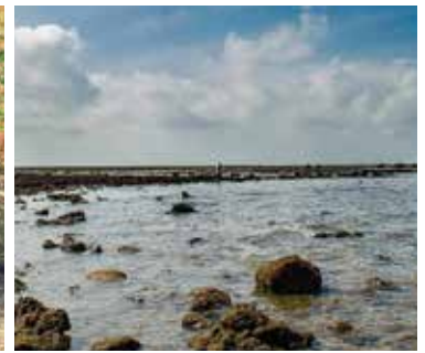
Marine National Park, Gulf of Kutch

Beaches: Boasting a 1600 km stretch, Gujarat's shoreline is the longest among India's nine seaside states' shores. If you have only been a witness to the intricate and historic landmarks of Gujarat, you are yet to explore the best through the expanse of Arabian Sea in the state.