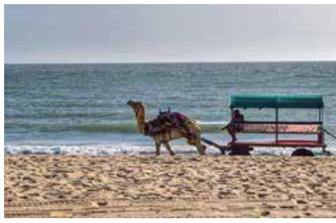
Mandvi beach, Kutch (384 km from Ahmedabad)