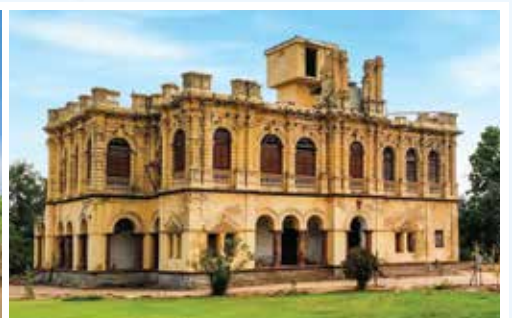
Sharad Bagh Palace, Kutch