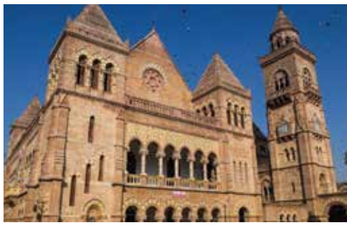
Prag mahal, Kutch