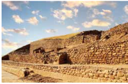
Dholavira (197 km from Ahmedabad)