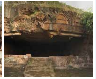
Talaja Caves (Bhavnagar district)

Gujarat's culture is steeped in values like hospitality and community bonding. The concept of "Atithi Devo Bhava" (Guest is God) is deeply ingrained, and visitors are welcomed with warmth and respect.