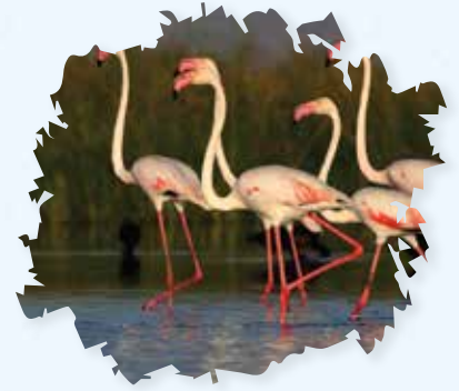
Nalsarovar bird sanctuary (62 km from Ahmedabad)