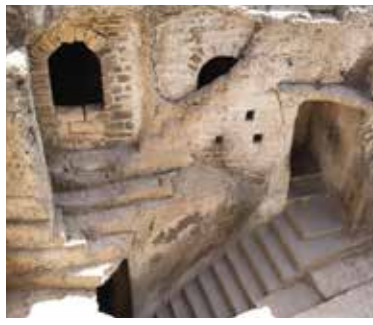
Uparkot Caves (Junagadh)