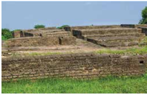
Lothal (197 km from Ahmedabad)

Indus Valley Civilization Sites: Gujarat is indeed a paradise for all the history lovers as it's is blessed with jaw-dropping feats accomplished by ancient civilizations. Gujarat has more than 200 Indus Valley Civilization sites.