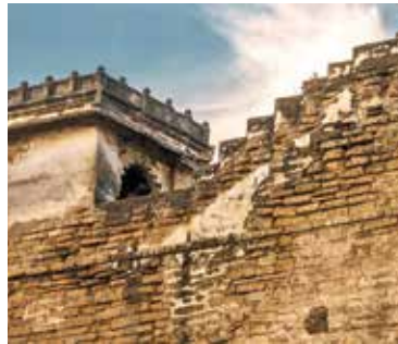
Bhujio dungar, Jamnagar