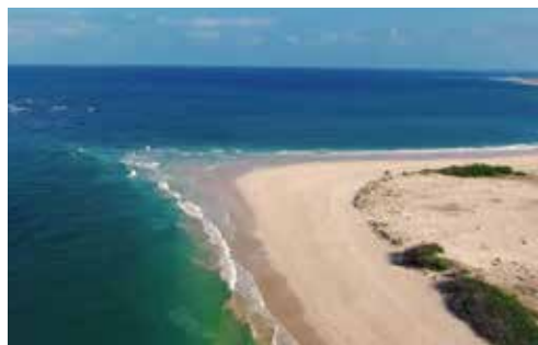
Okha Madhi beach, Devbhoomi Dwarka (425 km from Ahmedabad)