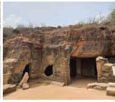
Siyot Caves (Kutch)