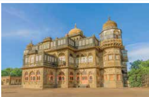
Vijaya Vilas Palace, Kutch