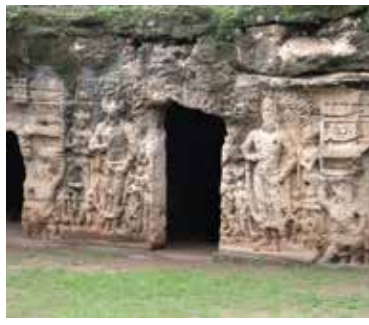
Khambhalida Caves (near Gondal, Rajkot district)