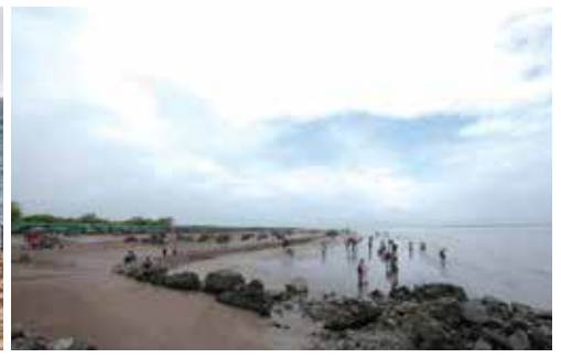
Dumas beach, Surat (286 km from Ahmedabad)

Religious Sites: The whole state of Gujarat is highly opulent with godly places of pilgrimage and holy temples Ambaji, Somnath, Dwarka, Palitana, Girnar, and Dakor are the chief holy places of Gujarat. Out of 51 "Aady Shakti Pith" the foremost "Aady Shakti Pith" of Ambaji, out of the 12 jyotirlings, the foremost jyotirling of Somnath, out of the "Sat puri", the foremost "Dwarka Puri", one of the "char dham", "Dwarkadham", the world renown biggest hindu temple, "Palitana" as well as Dakor, Girnar, and other religious places are situated in the state of Gujarat.