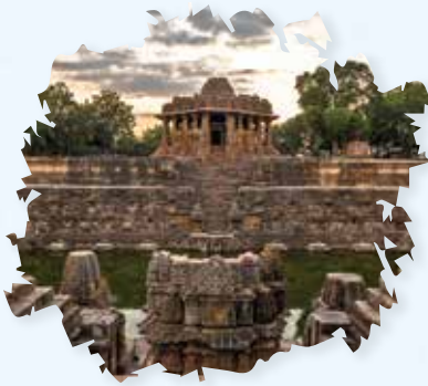
Modhera sun temple (mehsana) (99 km from Ahmedabad)