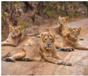
Gir Forest National Park