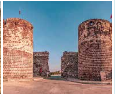
Lakhpat fort, Kutch