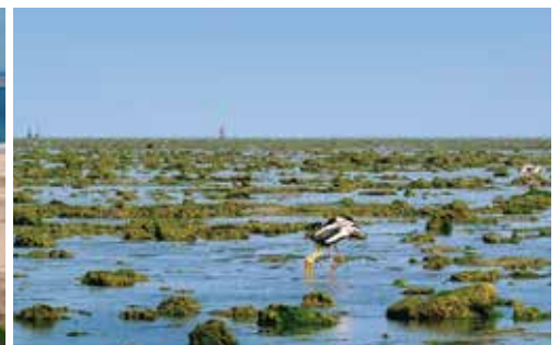
Pirotan island, Devbhoomi Dwarka and Jamnagar