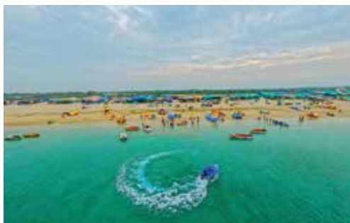
Shivrajpur Beach, Devbhoomi Dwarka (Blue Flag beach) (461 km from Ahmedabad)

Beaches: Boasting a 1600 km stretch, Gujarat's shoreline is the longest among India's nine seaside states' shores. If you have only been a witness to the intricate and historic landmarks of Gujarat, you are yet to explore the best through the expanse of Arabian Sea in the state.