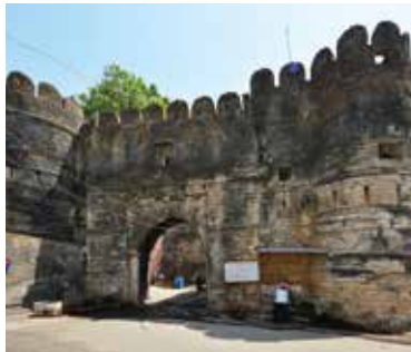
Uparkot fort, Junagadh