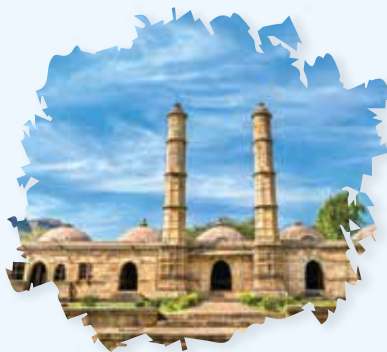
Champaner & Pavagadh Archeological park (UNESCO site) (46 km from Ahmedabad)