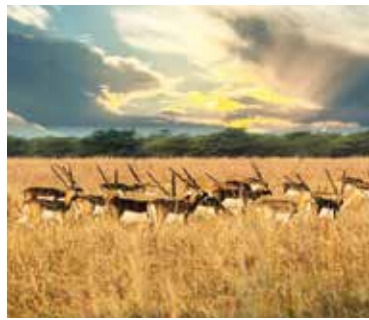
Blackbuck National Park, Velavadar